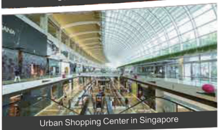
Urban Shopping Center in Singapore