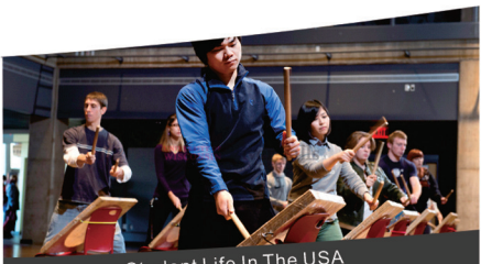
Student Life In The USA