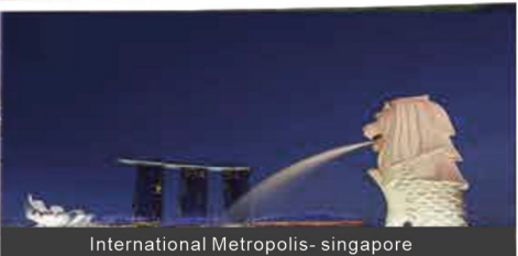
International Metropolis- singapore