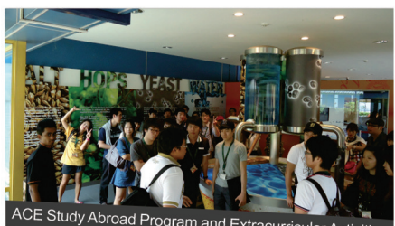
ACE Study Abroad Program and Extracurricular Activities