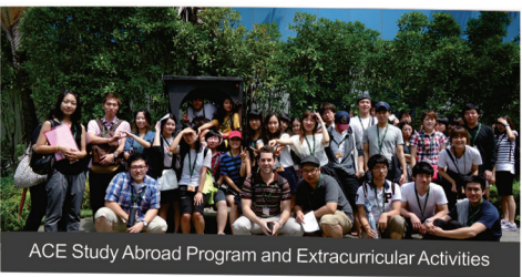
ACE Study Abroad Program and Extracurricular Activities