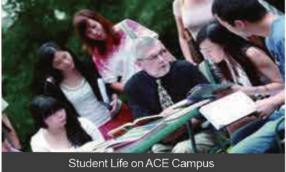
Student Life on ACE Campus