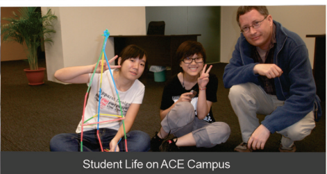
Student Life on ACE Campus