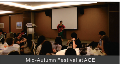
Mid-Autumn Festival at ACE