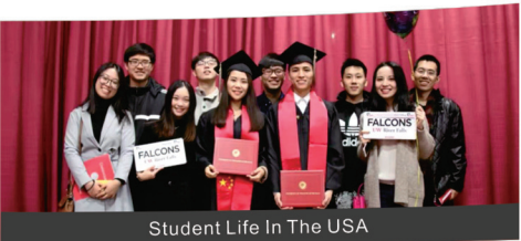
Student Life In The USA