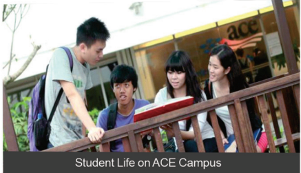
Student Life on ACE Campus