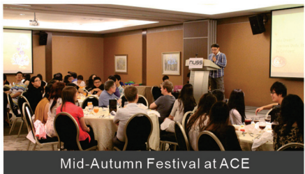
Mid-Autumn Festival at ACE