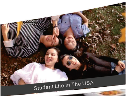
Student Life In The USA