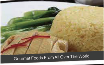
Gourmet Foods From All Over The World