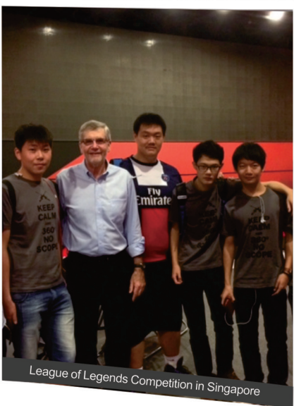
League of Legends Competition in Singapore